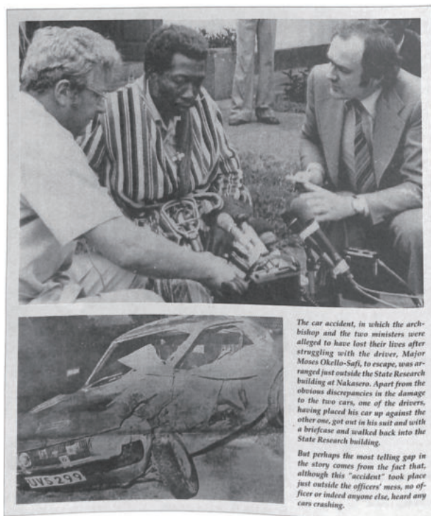
Fig.3 Drum reporting the 'plotted' accident 10

Operation Thunderbolt began with the high-jacking of Air France's Flight 139 by Palestinian guerrillas immediately after take-off at Athens Airport. Terrorists landed the plane at Uganda's Entebbe airport and took passengers, hostage, as they demanded the release of forty convicted terrorists. The Israeli Air Force raided Entebbe Airport for over 24 hours from 3 rd to 4 th July, recapturing hostages. They eventually released all but three passengers who died from