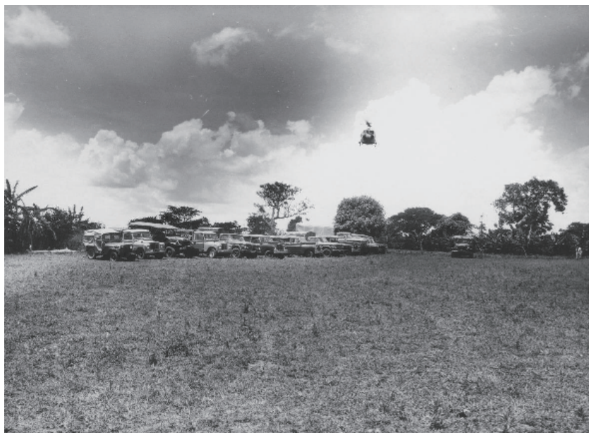
Fig. 8 Idi Amin arrived at the compound of ACK by helicopter (1972)

At the same time, upon ACK's suggestion to Amin's government, Rubongi Army barracks were invited to the area. People generally feared the presence of soldiers, especially around their families. In Uganda, it was rare to have a chapel next to one's home, and it was common to build a magical shrine next to the house, so metaphorically people perceived the chapel as a magical shrine. People believed that ACK's family's devotion to Christianity