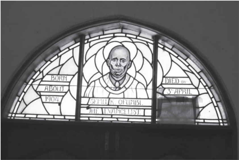
Fig. 10 Stained Glass of Semu Kole Ofumbi ©the Ofumbi family

to functional aspects such as guards and fences metaphorically.