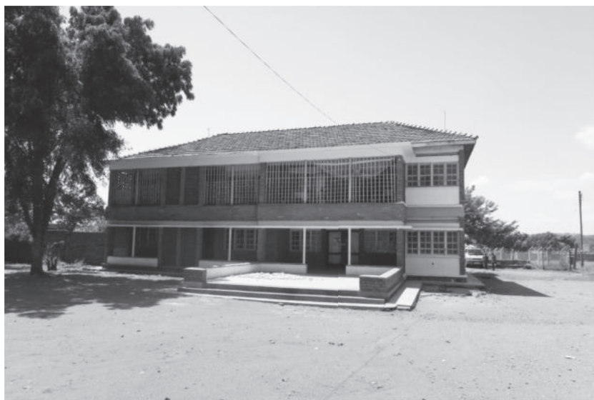
Fig. 6 The mansion of the late ACK in Nyamalogo, Tororo

When I first attempted to visit Nyamalogo village, people tried to dissuade me from going. They warned me about death, claiming I could be a victim like others who were dying in threes, one of them was killed by snakebites. Consecutive death, it was said, lurked everywhere, and one of ACK's uncles was also an alleged snakebite victim. While some accounts of death by snakebite were true, an interview with ACK's son revealed that the alleged uncle was not even a relative (Umeya 2016, 2018a: 519-565).