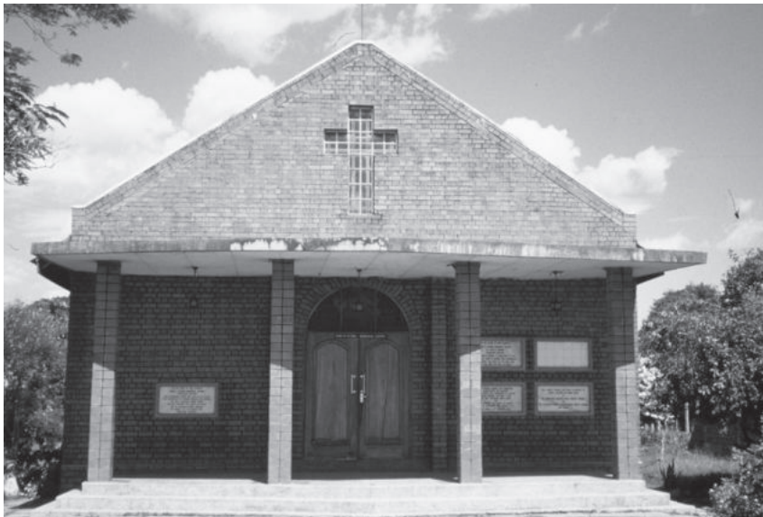
Fig. 9 Semu K. Memorial Chapel

In light of this, it may seem ironic to consider ACK as an author of an ethnography. His book includes the following description: 'The people of the Loli clan originally lived in Nyamalogo [where his house built] and later expanded their residence to Korobudi [where his father's tomb built]. Korobudi has the Oyalingoma Rock where they perform sacrifices' (Oboth-Ofumbi 1960: 58-60). Oyalingoma Rock is thus equivalent to a sanctuary, and purchasing it could attract bad omens.