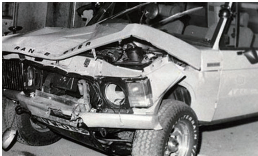
Fig. 4 Range Rover UVW082 allegedly broken at the accident 11

Another suggested motive is that Amin, who had overspent mosque construction funds received from Saudi Arabia, knew that a large sum of money was coming from the United Kingdom to Archbishop Janani Luwum